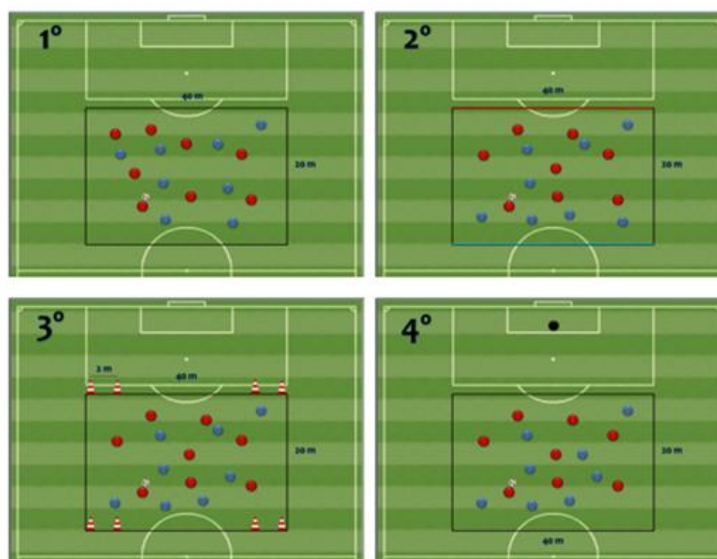
Figure 2 Graphic representation of the four small-sided games formats

The SSGs were carried out on a previously marked pitch, with dimensions of 20 metres wide and 40 metres long. Each small-sided game was played twice, with full possession in the attack phase for each team. Therefore, each time the defending team regained possession of the ball, they returned possession to the attacking team. Following the recommendations of Mallo (2013) and Verheijen (2014) each of the repetitions had a total duration of five minutes and between each of the series, a break of two minutes was taken.